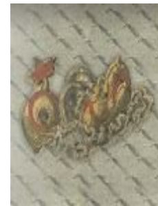
Society for Nautical Research, 1910.